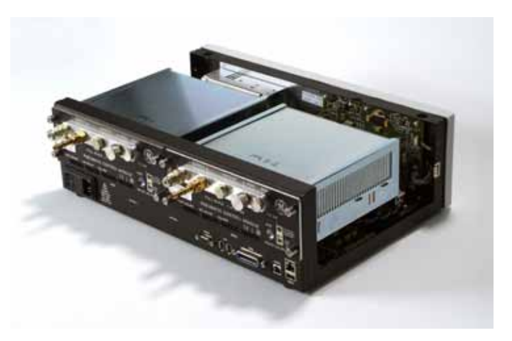
Pneumatic Control Module